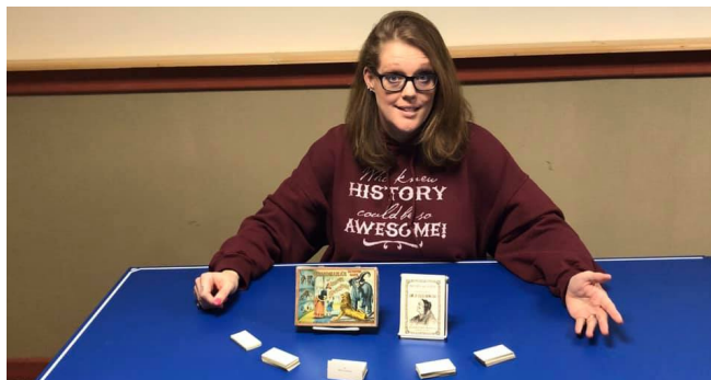
What is it Wednesday

Daily social media updates and new programming increased awareness of the Museum.